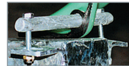
Cutaway of Pin

OVERALL DIMENSIONS 2760(L) X 2000(W) X 1336(H)