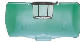
Cutaway shows full drain sump