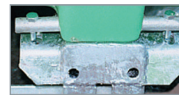
Outside view of Pin