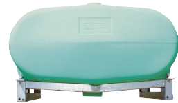
End view shows sump clearance