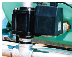
Remote controlled actuator