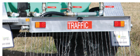
Dust suppression bar