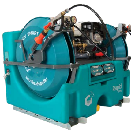
Twin Buddy Smart Reel® Version 360L