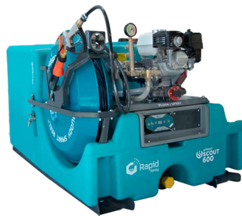
Single Buddy Smart Reel® Version 600L