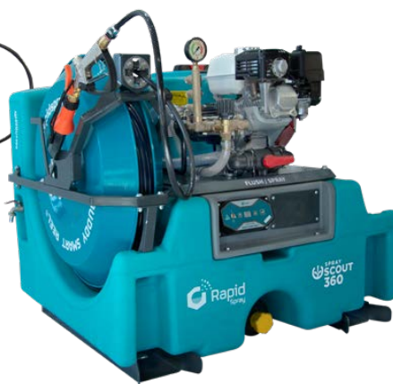
Single Buddy Smart Reel® Version 360L