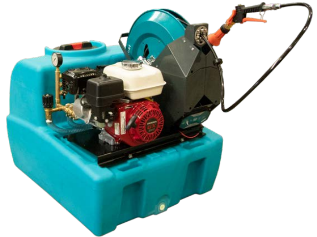
Buddy Marshal Disinfectant Sprayer PCU1885