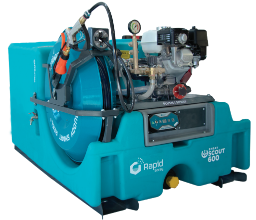
Single Buddy Smart Reel® Version 600L