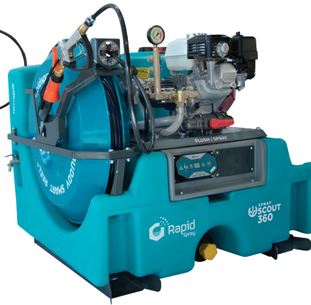
Single Buddy Smart Reel® Version 360L