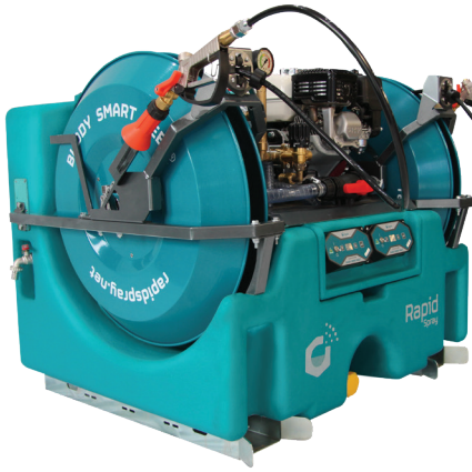
Twin Buddy Smart Reel® Version 360L