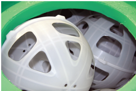
View through tank lid